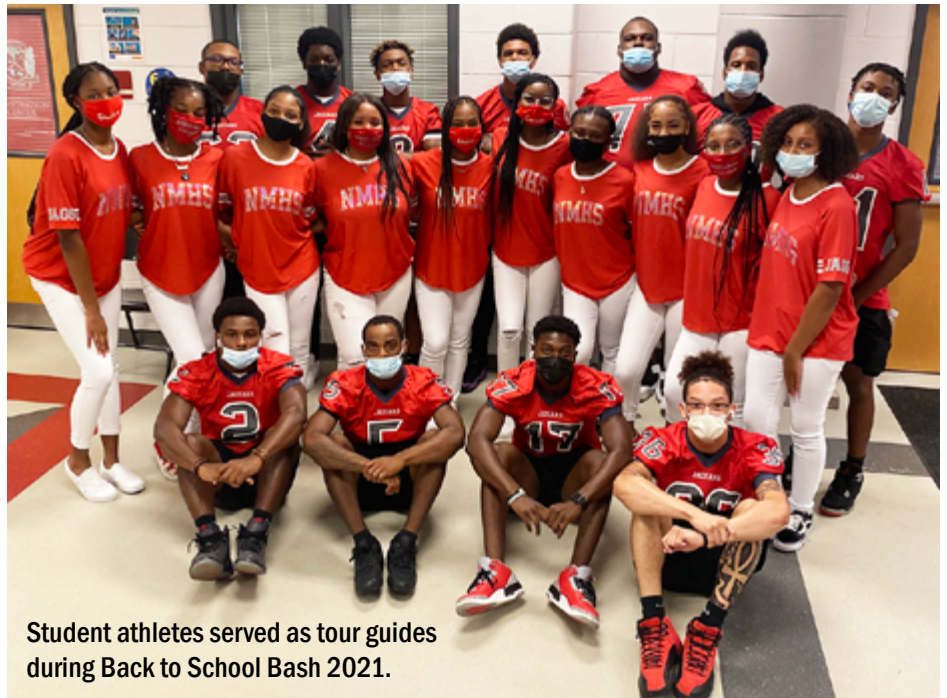
Student athletes served as tour guides during Back to School Bash 2021.